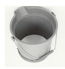
190-E20 Wash Bucket -Custom mesh sizes available