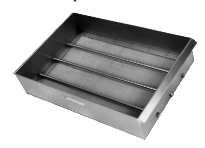
188-E10 Wash Frame, Complete