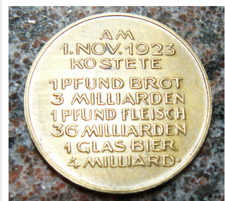
A medal commemorating Germany's 1923 hyperinflation. The engraving reads: "On 1st November 1923 1 pound of bread cost 3 billion, 1 pound of meat: 36 billion, 1 glass of beer: 4 billion."