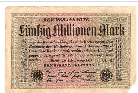
A 50,000,000 (50 million) mark banknote from 1923