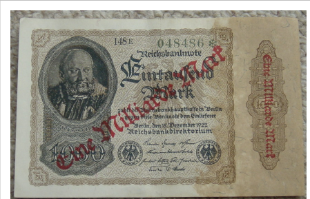
A 1000 Mark banknote, over-stamped in red with "Eine Milliarde Mark" long scale (1,000,000,000 mark), issued in Germany during the hyperinflation of 1923