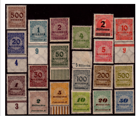
Postage stamps of Weimar Germany during the hyperinflation period of early 1920s

The German currency was relatively stable at about 60 Marks per US Dollar during the first half of 1921. [14] Because the Western theatre of World War I was mostly in France and Belgium, Germany had come out of the war