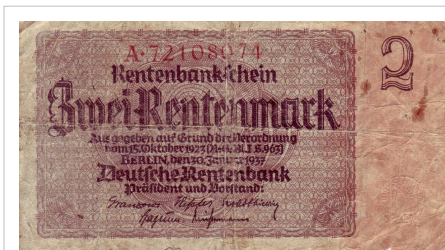
Two Rentenmark (Issued according Decree of 15th of October 1923, RGBL I S.963)

When the new currency, the Rentenmark, replaced the worthless Reichsbank marks on November 16, 1923 and 12 zeros were cut from prices, prices in the new currency remained stable. The German people regarded this stable currency as a miracle [20] because they had heard such claims of stability before with the Notgeld (emergency money) that rapidly devalued as an additional source of inflation. [21] The usual explanation was that the Rentenmarks were issued in a fixed amount and were backed by hard assets such as agricultural land and industrial assets, but what happened was more complex than that, as summarized in the following description.